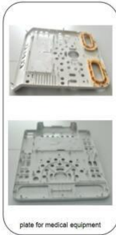
plate for medical equipment