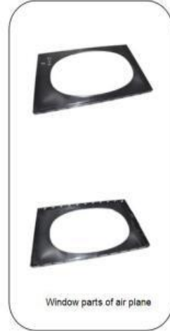
Window parts of air plane